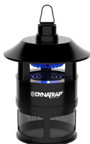
DT 160 (Coverage - ¼ acre)