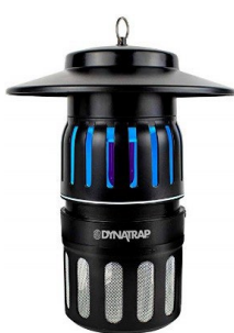
DT 1050 (Coverage - ½ acre)